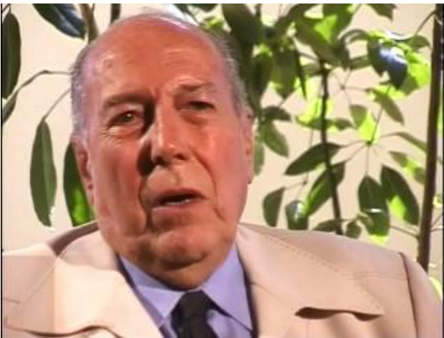
Mexican Air Force Col. Justino Reyes Retana vividly recalls his days with Escuadrón 201 as a P-47 pilot during World War II.

The all-volunteer unit was made up of the best fighter pilots, electricians, mechanics and radiomen in the Mexican Air Force, and had the overwhelming support of the Mexican government. Some of the men had been already been serving in the Mexican armed forces, while others were selected by competitive examination from civilian life.