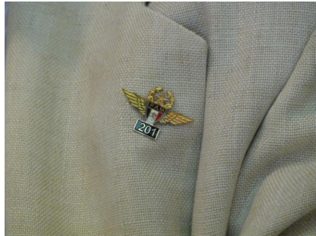
The replica of the original wings and squadron designation is worn on the lapels by all members of the Aztec Eagles.