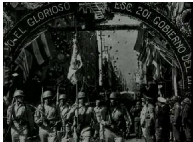
A vintage photograph from the parade in Mexico City shows the proud men of Escuadrón 201 marching through the streets as throngs of their countrymen greet them with a hero's welcome.

Enter Escuadrón 201, a band of 33 pilots and 270-plus ground support personnel from Mexico, who became known as the “ Aguilas Aztecas ” or Aztec Eagles. The squadron was